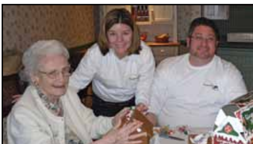
As part of United Way's Day of Caring, employees from Yellowbook spent a day with Masonic Village residents making gingerbread houses.