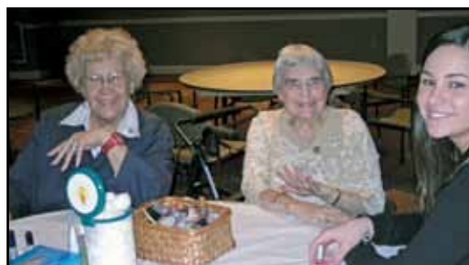
Students from Plymouth Whitmarsh High School volunteered to give manicures to Masonic Village residents.