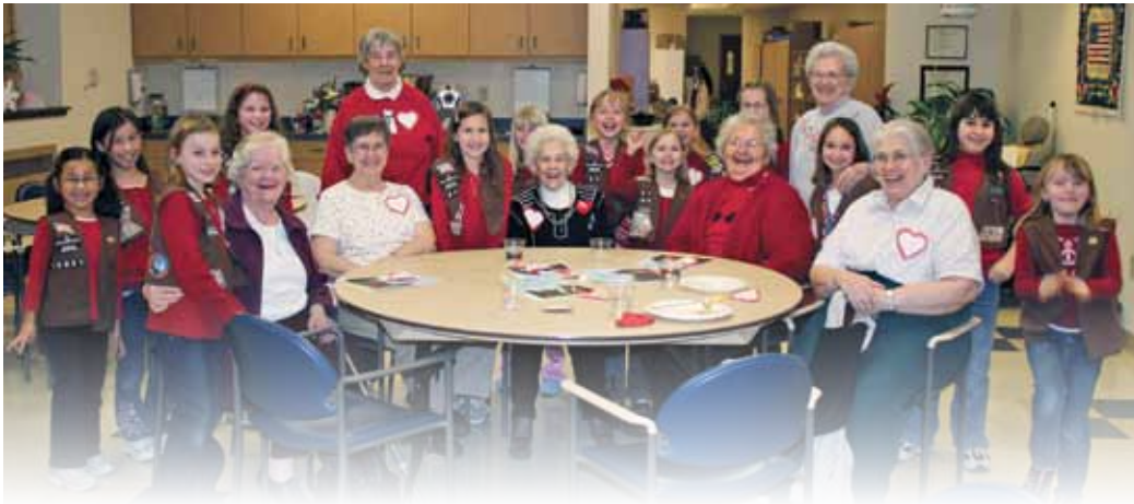
Brownie Troop #37, Elizabethtown, visited with Masonic Village residents to celebrate the American Heart Association's National Go Red Day. The group learned about heart disease, made pins, ate a healthy snack, completed educational tools and shared Girl Scout experiences together. The activity helped the Brownies earn their Go Red Girl Scout patch.